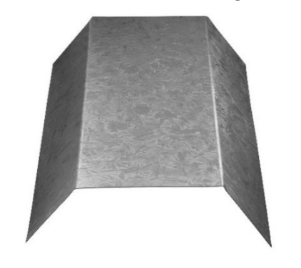
Half Cont Termite Shielding